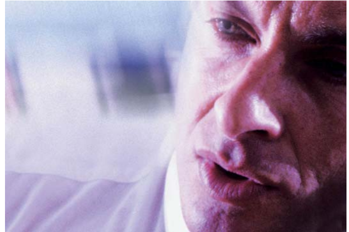
Integration ready surface mount wired button plates

We recommend additional cable fixing for support. A single screw is used for fixing the circuit board to the plate and some rotation may occur, check and centre at installation.